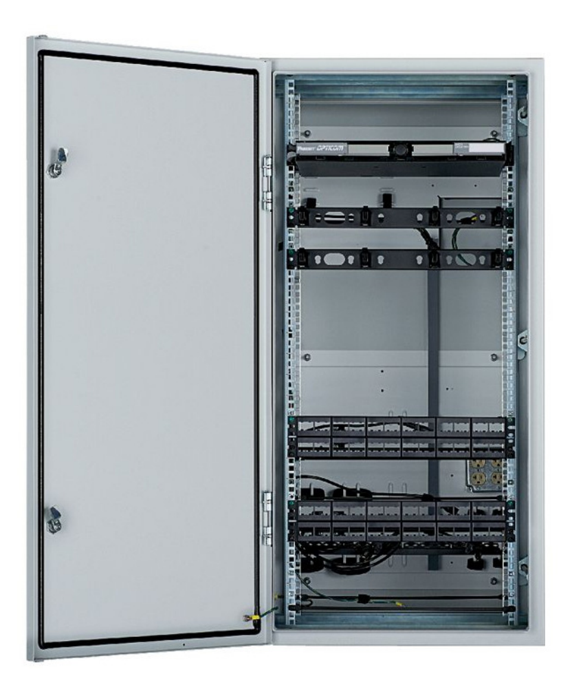
Figure 5 Panduit Pre-Configured IDF