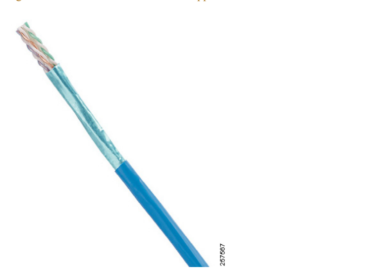
Figure 7 Panduit TX6A<sup>™</sup> UTP Copper Cable with Vari-MaTrix Technology

As an integral component of the end-to-end solution for industrial networks, the PNZS includes two industrial switches, 16 Category 6A STP copper patch cords and jacks, four MM LC fiber uplink patch cords with six adapters, redundant power supplies, and two Panduit maintenance-free 100W UPS devices.