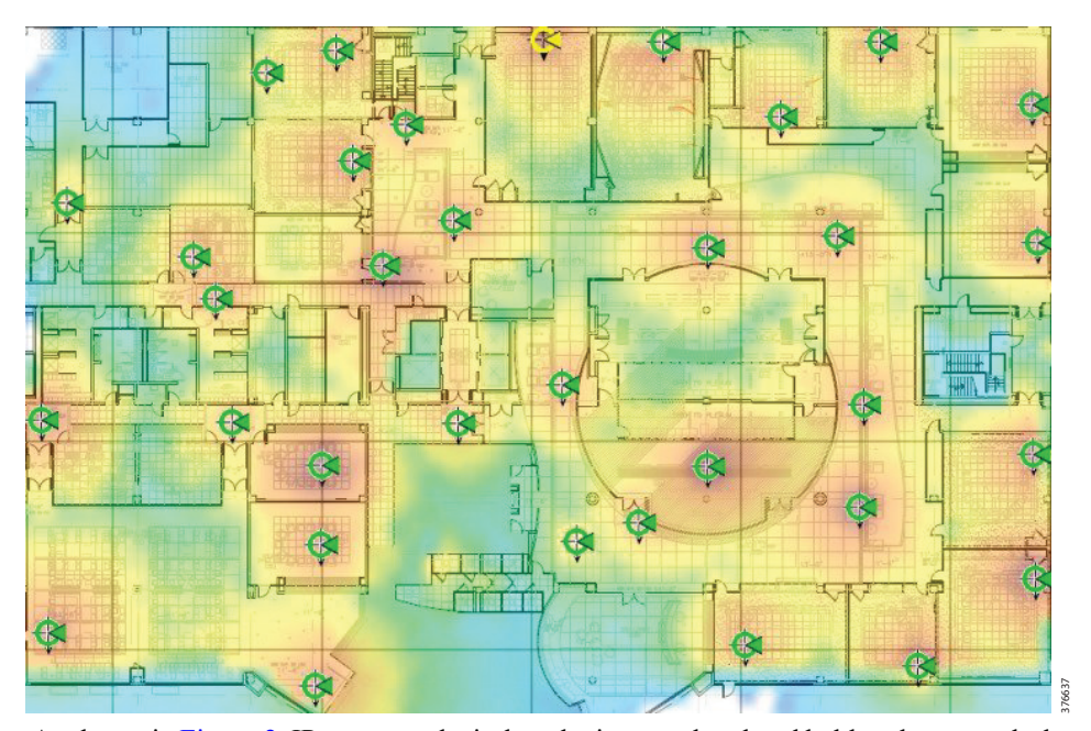
Figure 2 Path Analytics

As shown in Figure 2, IP-connected wireless devices, such as hand held tools, are each shown as they traverse the plant floor. In addition to recording the route that each tool has taken, how long each device remained at a specific station is also recorded. As shown in Figure 3, a new data point referred to as dwell time , or how long the tool remained at a given station, provides validation of business decisions about the use of various assets that may drive investment into additional tools or assets.