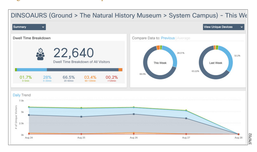
Figure 3 Dwell Time Report

As shown in Figure 2, IP-connected wireless devices, such as hand held tools, are each shown as they traverse the plant floor. In addition to recording the route that each tool has taken, how long each device remained at a specific station is also recorded. As shown in Figure 3, a new data point referred to as dwell time , or how long the tool remained at a given station, provides validation of business decisions about the use of various assets that may drive investment into additional tools or assets.