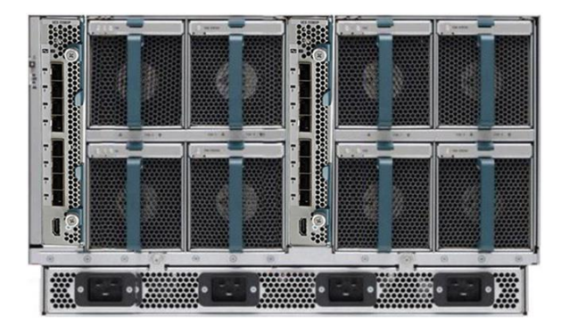
Figure 2. Rear of Cisco UCS 5108 Blade Server Chassis with Two Cisco UCS 2208XP Fabric Extenders Inserted

Cisco UCS 2200 Series Fabric Extenders fit into the back of the Cisco UCS 5100 Series chassis. Each Cisco UCS 5100 Series chassis can support up to two fabric extenders, allowing increased capacity and redundancy (Figure 2).