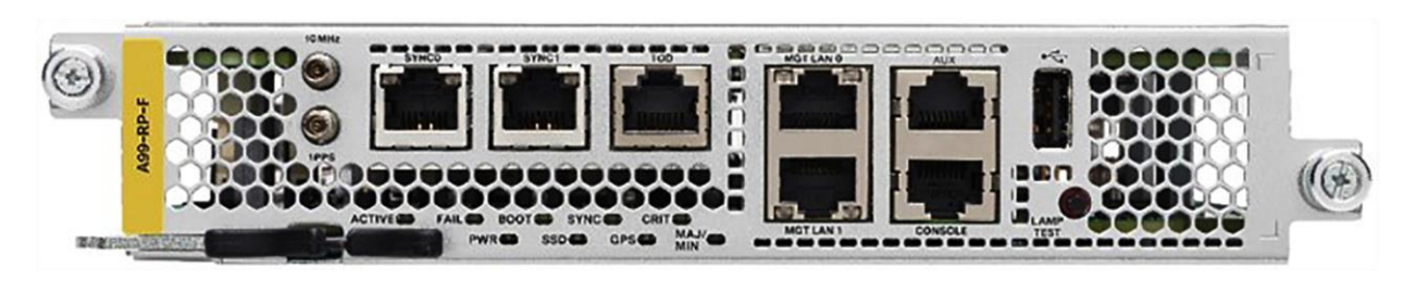
Figure 2. Cisco ASR 9903 Route Processor