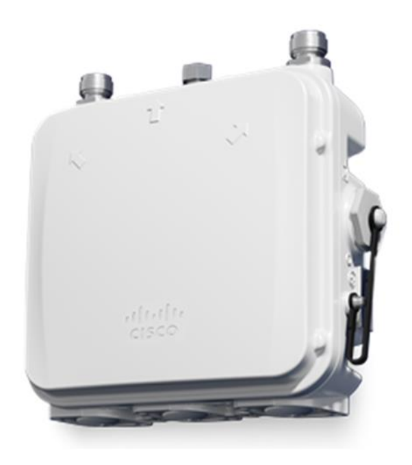
Figure 2. Catalyst IW9165D Heavy Duty Access Point

The Catalyst IW9165D is designed to make wireless backhaul deployment simple. It comes with a built-in directional antenna that enables long-range, high-throughput connectivity anywhere fiber is not an option, so you can create a fixed wireless infrastructure (point-to-point, point-to-multipoint, and mesh) as well as backhaul traffic from mobile devices along wayside or trackside deployments. The external antenna ports let you quickly extend your network to new places when needed and choose the right antenna based on the use cases and deployment architectures. With heavy-duty IP67 design, the Catalyst IW9165D is certified to operate under wet, dusty, and extreme temperature conditions.