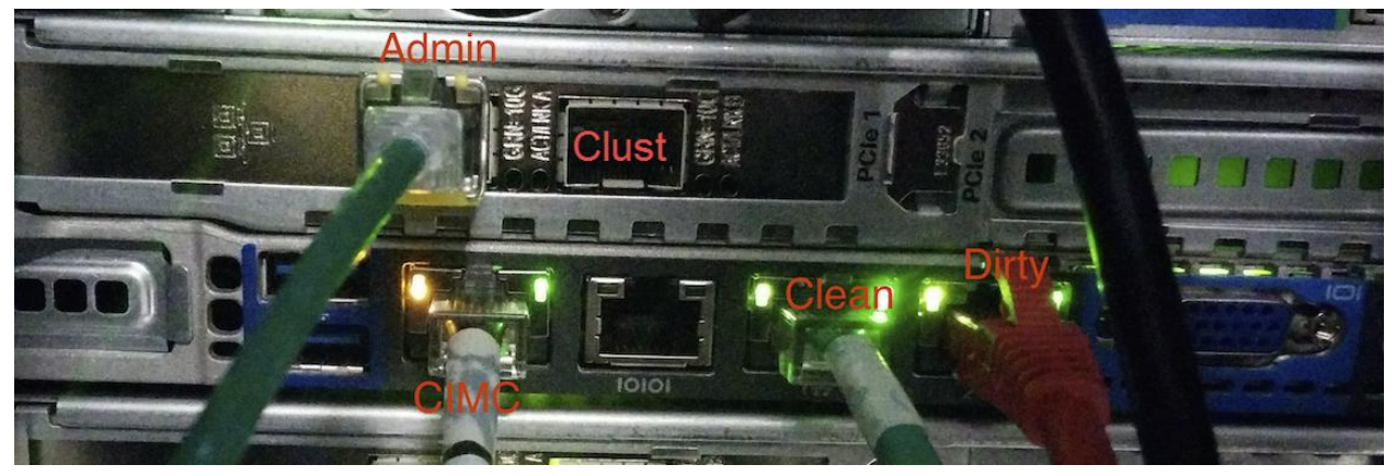
Figure 2 - Clust Interface Setup for Cisco UCS M4 C220

Install a SFP+ module in the 4th (non-Admin) SFP port that was previously labeled Reserved ; it is now used for the Clust interface, as illustrated in the next two figures: