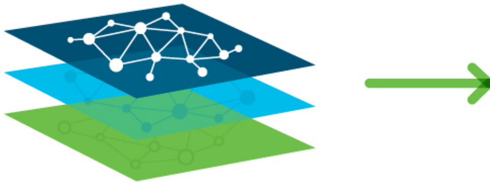
Figure 2. Network-wide model of the underlay, overlay, and virtualization layers

Leveraging formal mathematical techniques and a deep understanding of the networking domain, the Cisco NAE software is able to answer three fundamental questions about the network: