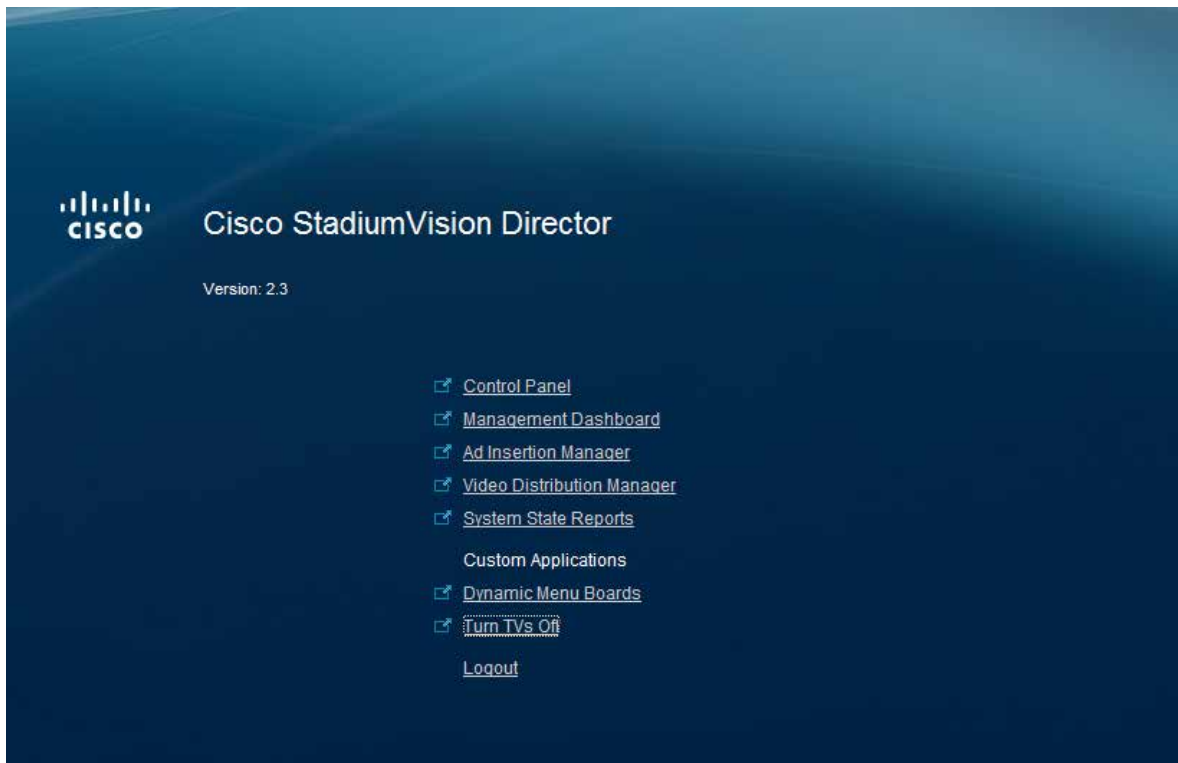
Figure 1. Cisco StadiumVision Director Main Menu in Release 2.3