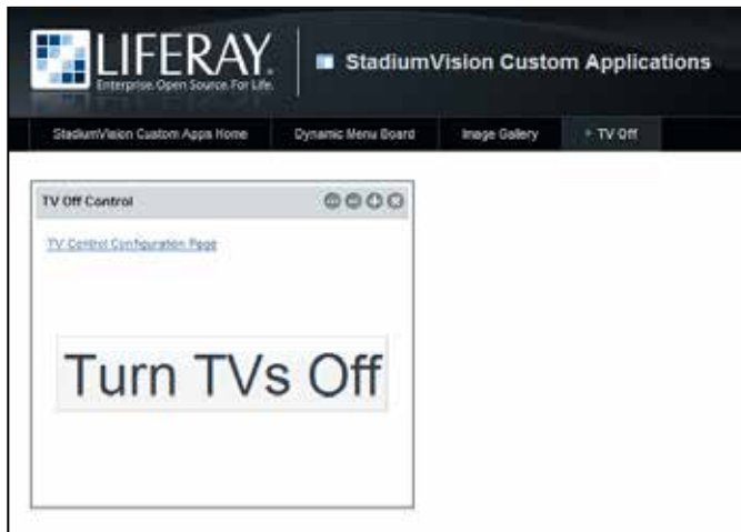
Figure 6. Cisco StadiumVision TV Off Control Page (Administrator)