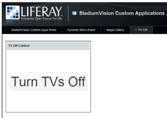
Figure 5. Cisco StadiumVision TV Off Control Page (Event Operator and Facility Operator)