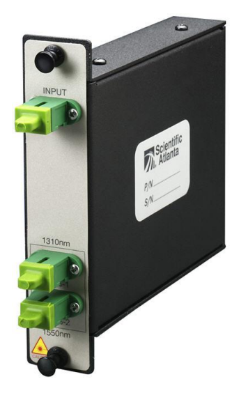
Figure 1. 3-Port BWDM (1 LGX, Left) and NC/BC Combiner (4 LGX, Right)

The Prisma BWDMs are packaged in an industry standard LGX-style module for indoor applications and in raw-filter style for outside plant usage.