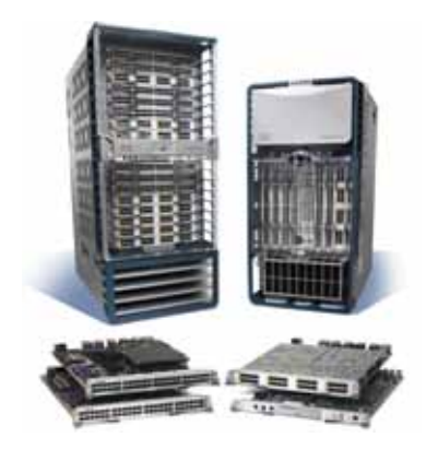
Figure 1. Cisco Nexus 7000 Switch Series

The Cisco® Nexus 7000 Series (Figure 1) is the first in a new generation of data center–class switches and expands the Cisco portfolio of data center switching solutions. As the network platform for Cisco Data Center 3.0, the Cisco Nexus 7000 Series delivers new levels of operational continuity, transport flexibility, and infrastructure scalability to meet the demands of the next-generation data center. The Cisco Nexus 7000 Series also positions customers to effectively address emerging data center trends such as resource virtualization, faster transport (40 Gigabit Ethernet and 100 Gigabit Ethernet), and unified fabric with a hardware and software architecture designed for investment protection.