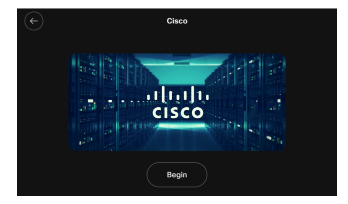
Figure 6: Example of CiscolPPhoneImage Object Display on Cisco Video Phone 8875

The CiscoIPPhoneImage XML type lets you use the IP phone display to present graphics to the user.