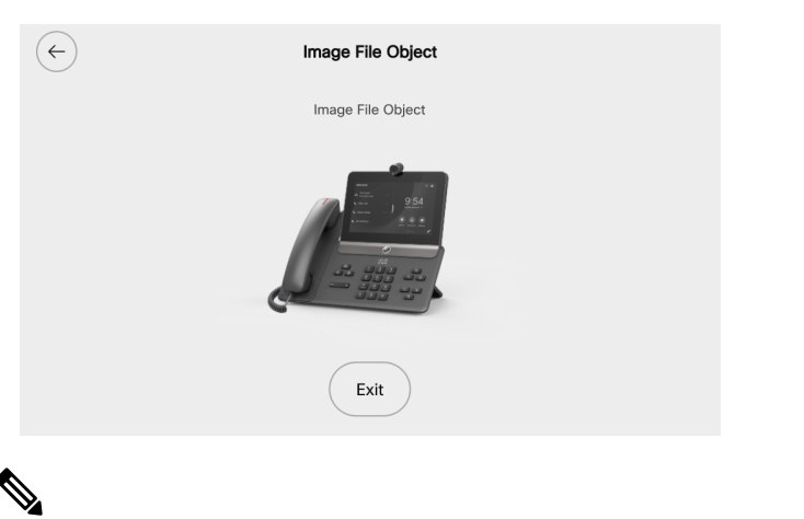
Figure 8: Example of CiscolPPhoneImageFile Object Display on Cisco Video Phone 8875