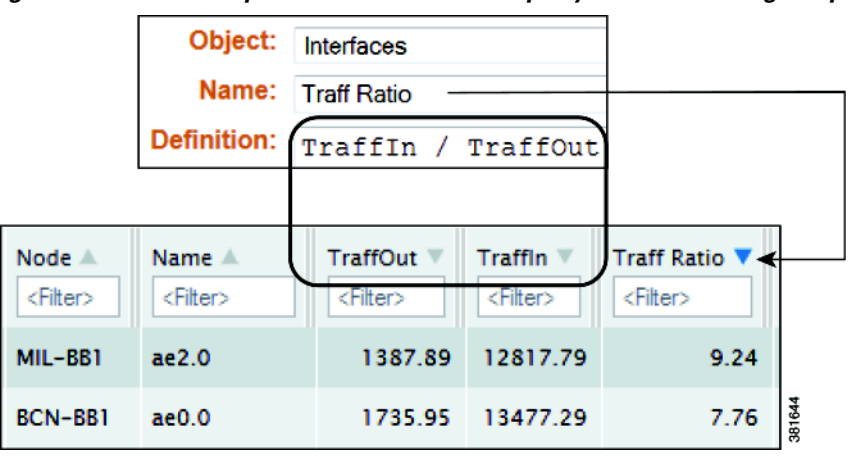
Figure 5-1 Example of a User-Defined Property Definition Using Simple Arithmetic Expression

For two-word properties, use one word in the definition. For example, for the Remote Node property, use "remotenode." For Traffic In and Traffic Out properties, use "traffin" and "traffout" in the definition.