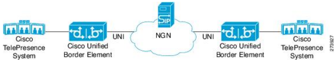
Figure 1: Cisco NGN with CCUBE providing UNI interface