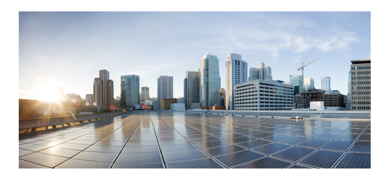
QoS: Regulating Packet Flow Configuration Guide, Cisco IOS XE Fuji 16.8.x

Americas Headquarters Cisco Systems, Inc. 170 West Tasman Drive San Jose, CA 95134-1706 USA http://www.cisco.com Tel: 408 526-4000 800 553-NETS (6387)