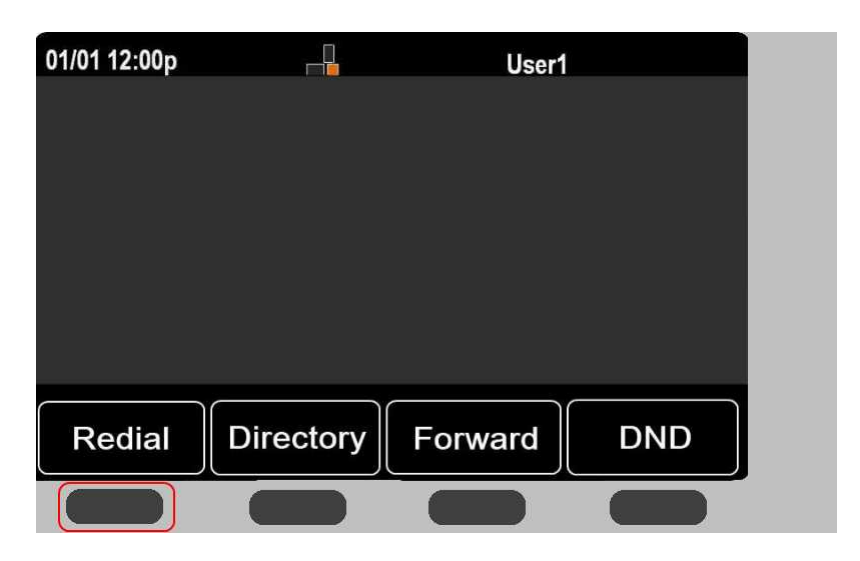
Step 1. Select Redial on the phone.