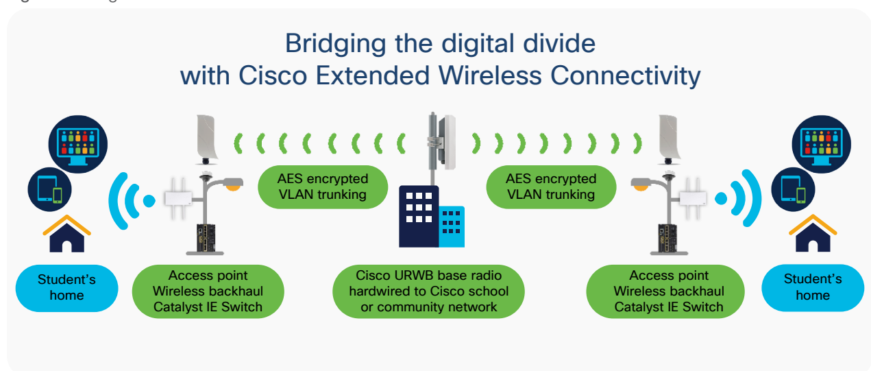
Figure 1. High-level overview of how the architecture works

*Pew Research: https://www.pewresearch.org/fact-tank/2020/09/10/59-of-u-s-parents-with-lower-incomes-sav-their-child-mav-face-digital-obstacles-in-schoolwork/