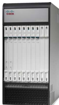
Figure 1. Cisco ASR 5500 Multimedia Core Platform

With all these factors, mobile operators need a mobile packet core solution that they can count on - one that provides efficient evolution to fourth-generation (4G) technology and small cells. Operators must plan for the 'new normal' of the mobile internet - elastic, flexible, virtual. This means being able to harness the right resources (intelligent performance) when you need them - instantaneously. This new normal starts with the intelligent performance of the Cisco® ASR 5500 Multimedia Core Platform (Figure 1). Cisco ASR 5500 sets a new standard for intelligent performance that redefines the economics of the packet core. It is the first mobile platform designed for terabit performance that scales to tens of millions of sessions, and supports the transaction rates required to address the signaling surge.