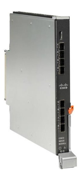
Figure 4. Cisco Nexus B22 Blade Fabric Extender for Dell