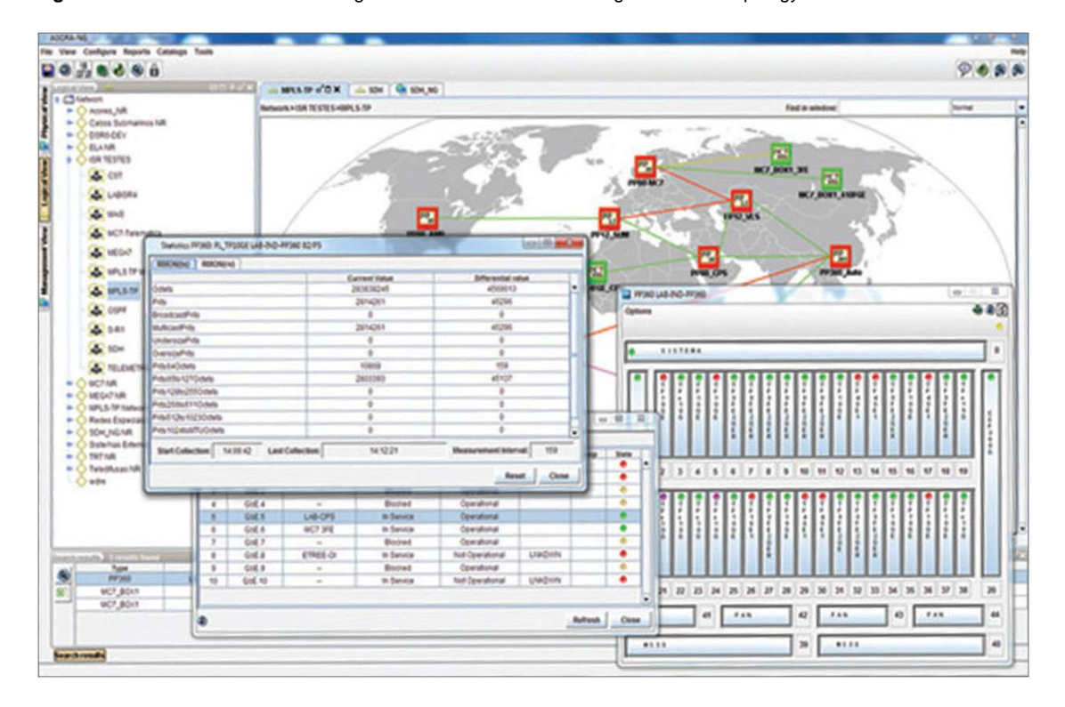
Figure 3. Cisco ME 4600 Series Agora-NG NMS Resource Manager Network Topology

The topology-management module provides graphical tools for operators to build the network topology (Figure 3). A hierarchical topology map is included, offering a real-time graphical representation of the network Inventory, with a color code to represent the network status. It also shows resource availability for each link, acting as a powerful tool for network traffic planning. Cisco ME 4600 Series Agora-NG Resource Manager includes a fault management module, the Alarm Monitor. It promotes the detection of network and service faults in real time and presents them as alarms in an intuitive web-based interface. It correlates alarms, providing root cause analysis and information on how services are affected. It also provides alarm notification by SMS and email.