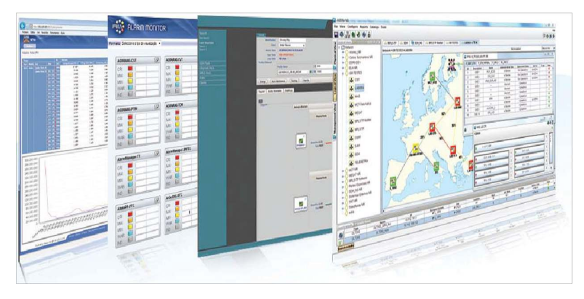
Figure 1. Cisco ME 4600 Series Agora-NG Graphical User Interface