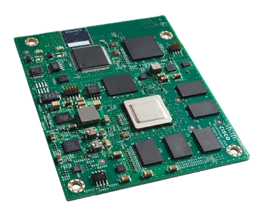
Figure 1. Cisco ESR6300 NCP (no cooling plate)

Cisco has an ecosystem of partners and systems integrators that embed Cisco ESR6300s into industry-standard, commercially available enclosures as well as custom enclosures tailored to the unique environments in which these routers are deployed. Figures 1 and 2 show the Cisco ESR6300 NCP (no cooling plate) and ESR6300 CON (conduction-cooled) models, respectively.