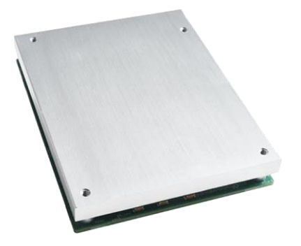
Figure 2. Cisco ESR6300 CON model (with cooling plate)