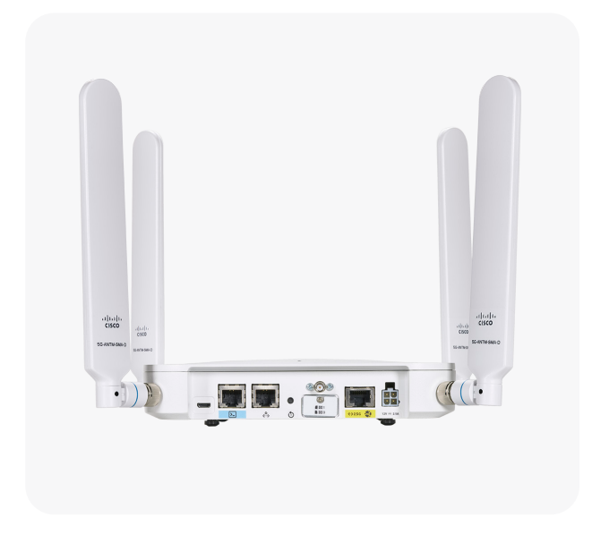
Figure 2. Port Density in the Cisco Cellular Gateway