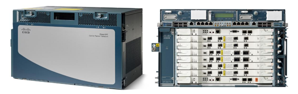
Figure 1. Cisco CPT 600 Carrier Packet Transport (with front cover (left), without front cover (right))

The CPT platform has great revenue potential for service providers by providing TDM like Ethernet Private lines as well as multipoint capabilities for Business, Residential, Mobile Backhaul, Data Center, and Video Services. These next generation of services can be readily deployed at low operational costs using the Cisco Transport Controller (CTC) and Cisco PRIME that allow fast and simple network turn up, A to Z provisioning and OAM features.