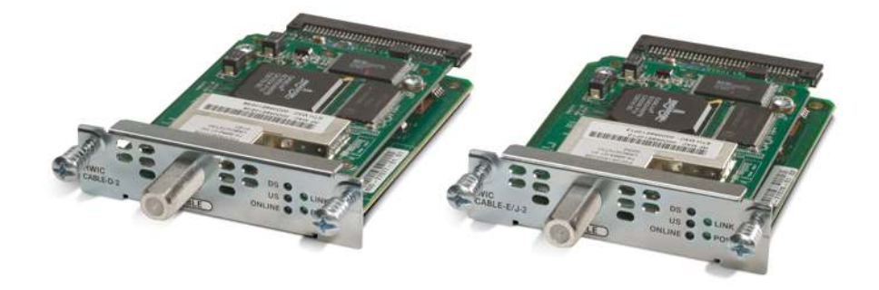
Figure 1. Single-Port DOCSIS 2.0 and Euro/J-DOCSIS 2.0-Based Cable HWICs (HWIC-CABLE-D-2 and HWIC-CABLE-E/J-2)

Both the 1-port DOCSIS-based cable HWIC and the one-port Euro/J-DOCSIS-based cable HWIC cards provide a single F-connector for broadband connectivity. The cable HWICs are supported starting with Cisco IOS Software Release 12.4(11)T. Cable operators can use the Cisco ISRs and Cisco IAD2430 Series when combined with the cable HWICs to provide a vast array of business services, including voice, video, data, security, wireless, switching, and content caching over the DOCSIS network.