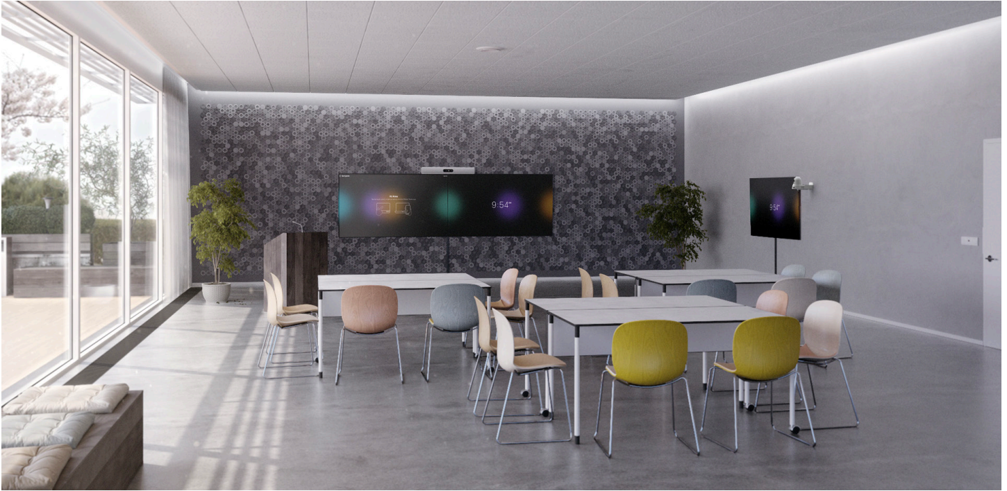
Figure 1. Webex Room Kit Pro PTZ 4K bundle with an additional Webex Quad Camera unit deployed in a custom briefing room

The Webex® Room Kit Pro PTZ 4K Integrator Bundle is a powerful collaboration solution that integrates with up to three flat-panel displays to bring more intelligence and versatility to your collaboration spaces. Ideal locations for this solution include large, custom video rooms, boardrooms, auditoriums, classroom theaters, conference rooms, purpose-built workspaces for vertical applications, and more. The integrator bundle combines the performance of the Webex Codec Pro collaboration engine, the flexibility of the Webex PTZ 4K pan-tilt-zoom camera and the purpose-built Webex Room Navigator table stand control panel to offer maximum flexibility and premium video collaboration in scenarios where you need special camera placement, want to view objects close up, or want to view a wide area with pan-tilt-zoom capability.