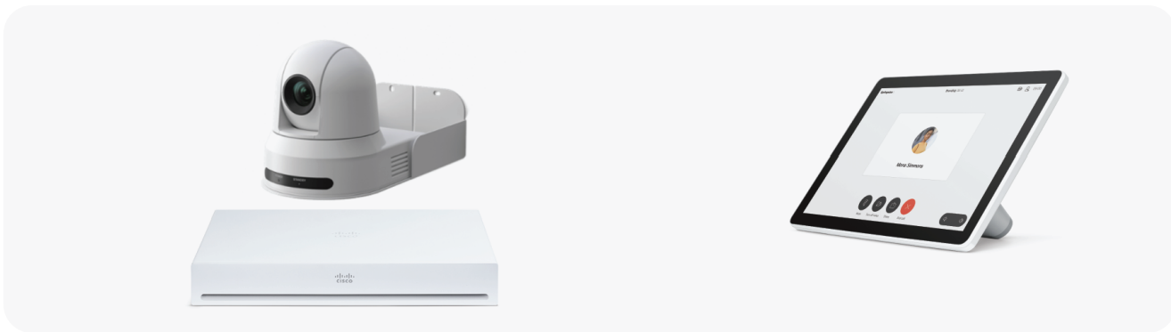
Figure 2. Webex Room Kit Pro PTZ 4K integrator package with Webex Codec Pro, the Webex PTZ 4K Camera, and Webex Room Navigator

The Room Kit Pro PTZ 4K bundle is rich in functionality and experience, and is priced and designed to be easily scalable to all of your collaboration spaces—whether registered on the premises or to the Webex cloud service. Figure 2 shows the default components of the package.