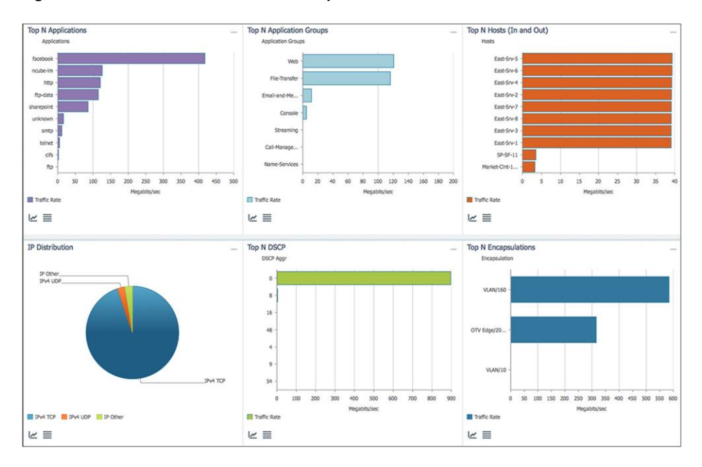
Figure 1. Cisco Prime NAM Traffic Summary Dashboard

Cisco Prime <sup>™</sup> Virtual Network Analysis Module (vNAM) delivers operational agility by permitting deployment almost anywhere in the network to improve service levels. You can deploy the vNAM in the cloud to monitor hosted workloads, at remote sites to characterize the end-user experience, or almost anywhere in the network to eliminate blind spots. It combines deep application awareness, insightful performance analytics, and comprehensive network visibility to empower network administrators to efficiently and effectively manage their networks.