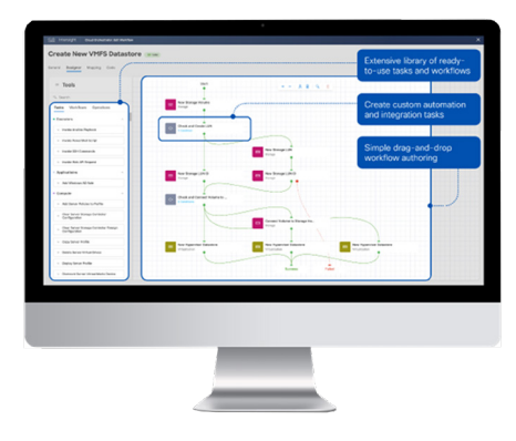
Figure 2. Accelerate delivery of applications and infrastructure using a drag-and-drop automation and workflow designer