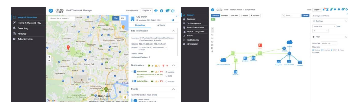
Figure 1. Network Map and Site Topology

Figure 1 and Figure 2 show different views of the application at work, while Figure 3 shows a typical deployment of FindIT Network Manager.