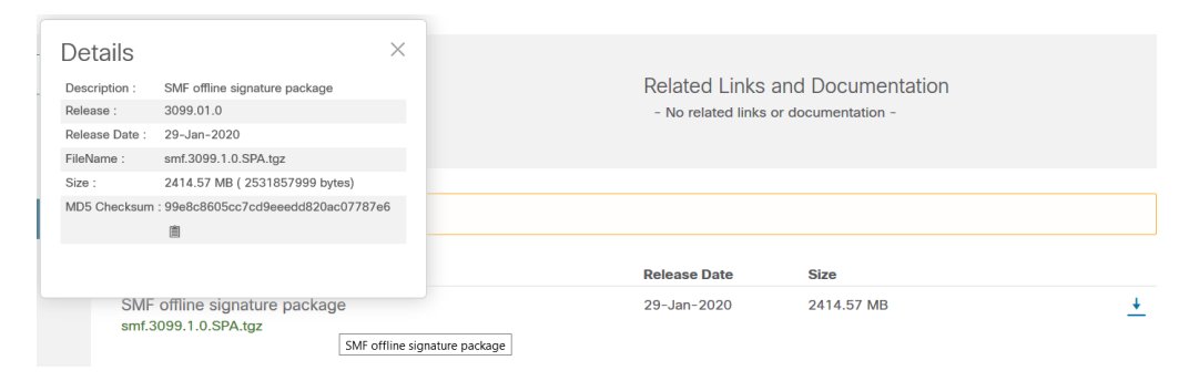
Image checksum information is available through Cisco.com Software Download Details. To find the checksum, hover the mouse pointer over the software image you have downloaded.

At the bottom you find the SHA512 checksum, if you do not see the whole checksum you can expand it by pressing the "..." at the end.