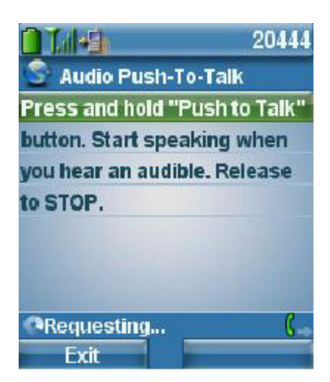
Figure 2-13 Push-to-Talk Screen with Audio Indicator

The recipients will see a similar screen on their phones and will hear an audible tone, except that the direction of the audio path will be reversed (depicting incoming audio).