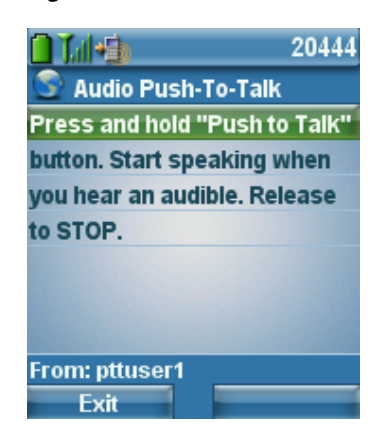
Figure 2-12 Push-to-Talk Application Screen

Once invoked, the Push-to-Talk application broadcasts the first application screen to the organizer's IP phone, as shown in Figure 2-12.