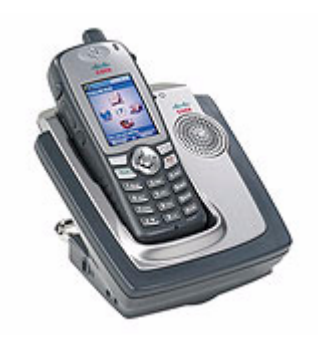
Figure 1-1 Cisco Unified Wireless IP Phone 7921G

Push-to-Talk functionality includes the following features: