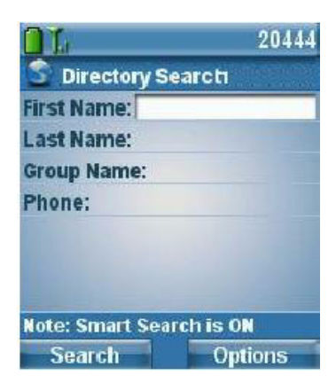
Figure 2-6 Quick Connect Directory Search Screen

Step 6 Select Search to search the Quick Connect Directory and display the results. Quick Connect Smart Search will return all first names that match: A-J-D, A-J-E, A-J-F, B-J-D, B-J-E, B-J-F, C-J-D, C-J-E, C-J-F, A-K-D, A-K-E, A-K-F, B-K-D, B-K-E, B-K-F, C-K-D, C-K-E, C-K-F, A-L-D, A-L-E, A-L-F, B-L-D, B-L-E, B-L-F, C-L-D, C-L-E, C-L-F. Only the items in bold are found in the directory and returned as search results. In this example, Quick Connect Smart Search allows you to perform over 25 simultaneous search types with only 3 button presses on the IP phone.