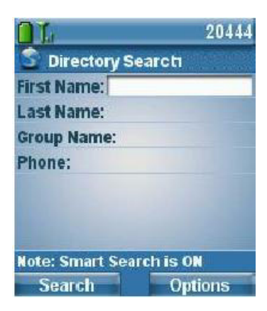
Figure 2-2 Quick Connect Directory Search Screen

Step 6 Select Search to search the global directory and display the results (Figure 2-3).