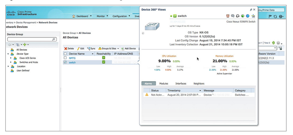
Figure 3. Cisco Nexus 9000 Series 360-Degree Views Provide Extensive Details on the Health of the Device

Manages Cisco Nexus<sup>®</sup> Series Switches: Adds management of <u>Cisco Nexus 9000</u> <u>Series Switches</u> (Figure 3) to its arsenal of <u>Cisco Nexus data center switches</u> and <u>Cisco MDS Series Switches</u>.